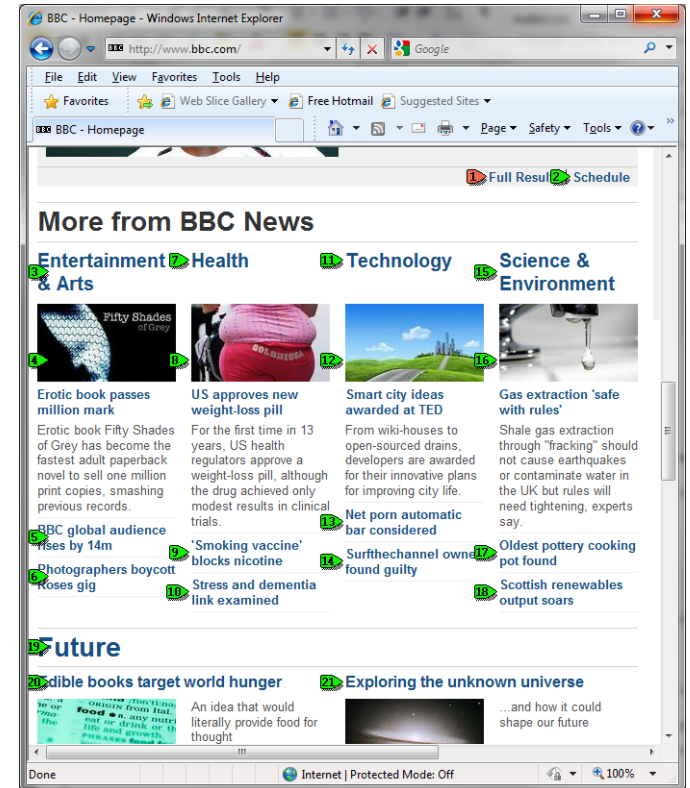
Figure 1: Webpage with Numbered Markers on Links